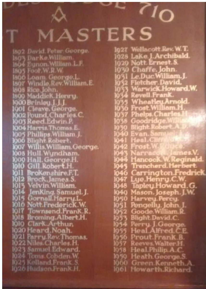
Pleiades Lodge Past Masters Board showing some of the names mentioned in this document