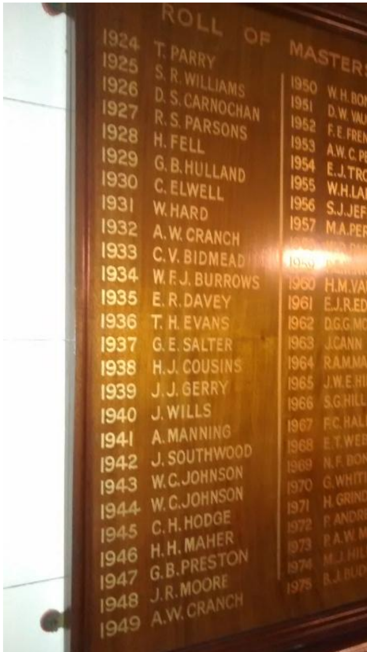
Dartmoor Lodge Past Masters board showing some of the names mentioned in this document