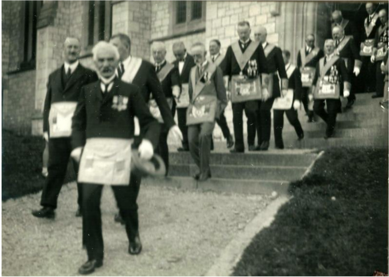
Brethren processing in full regalia for the Foundation Stone ceremony 16 th Aug 1939